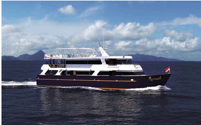
MV Mermaid I

Master Suite – one suite with one double bed and panoramic windows looking forward over the bows, for an extra £400 per person.