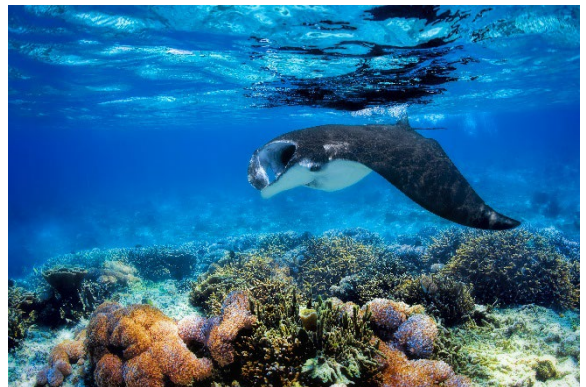
From top: Raja Ampat island, Spinner Dolphins, Manta Ray