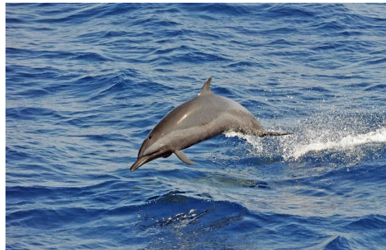
Spotted Dolphin